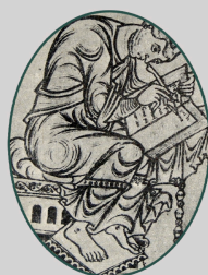
Historiae adversus paganos (418) Paulus Orosius