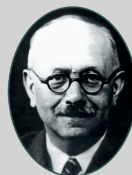
Les rois thaumaturges (1924) Marc Bloch